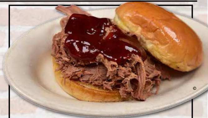
SHREDDED BEEF OR SHREDDED PORK - 12

You pick your favorite, hand breaded or grilled - 13